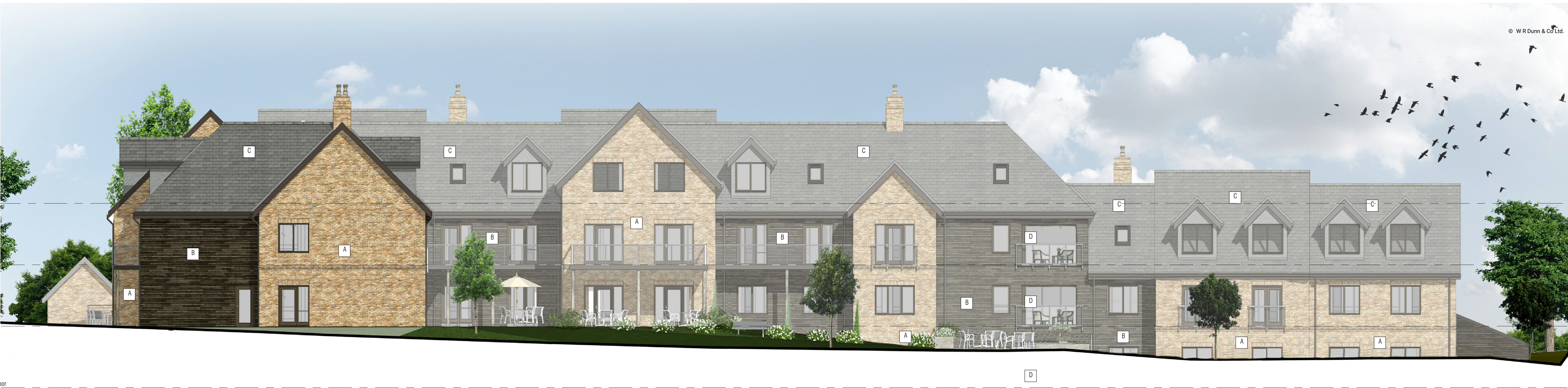
1 South Elevation 1 : 100