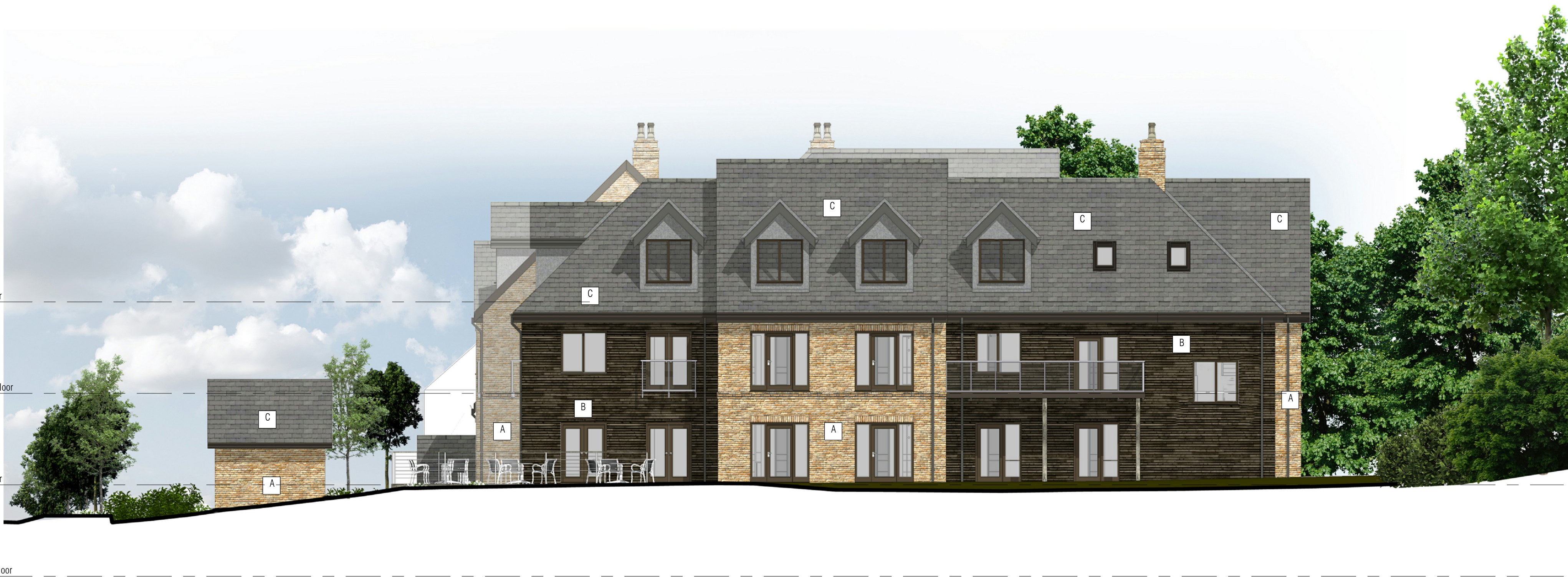
2 West Elevation 1 : 100