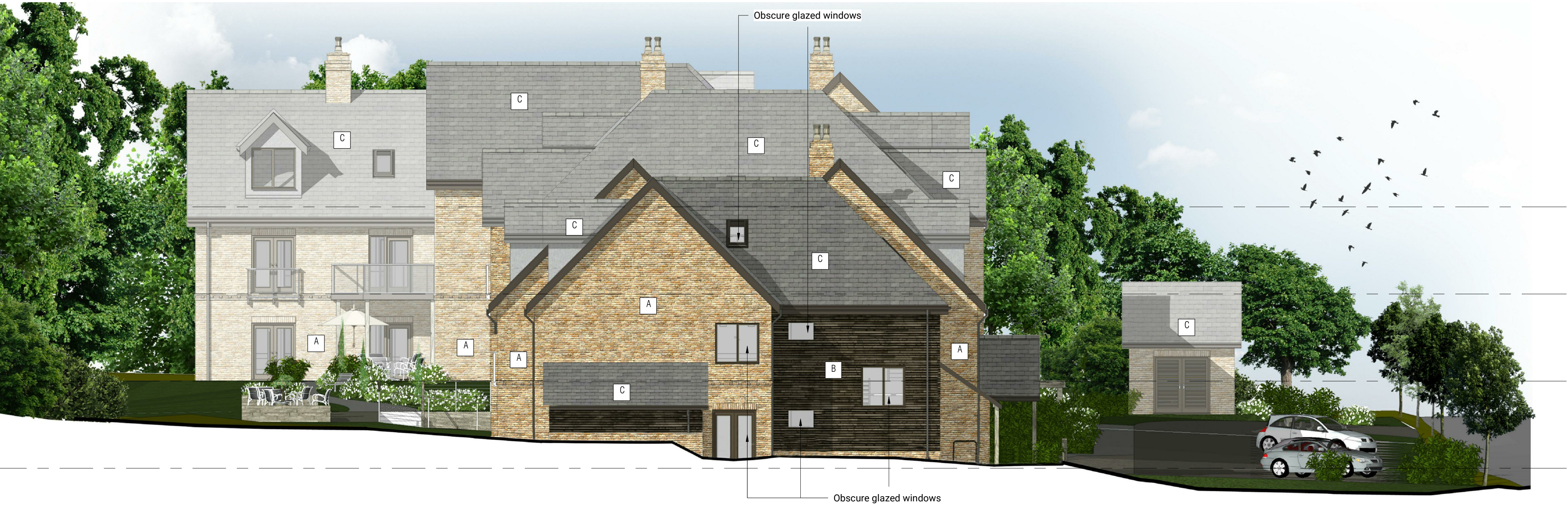
2 East Elevation 1 : 100